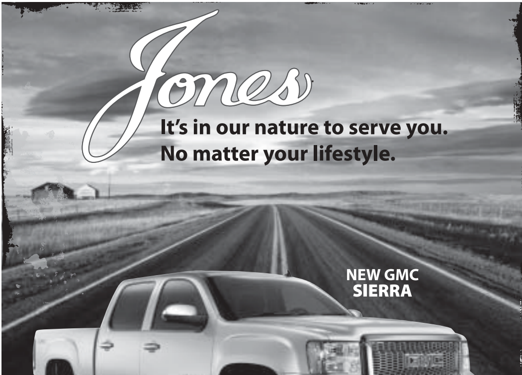
NEW GMC SIERRA

It's in our nature to serve you. No matter your lifestyle.